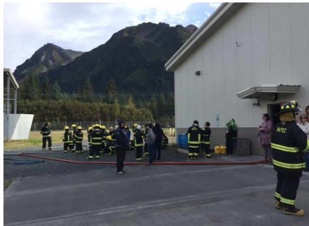
Teaching MS students fire fighting techniques