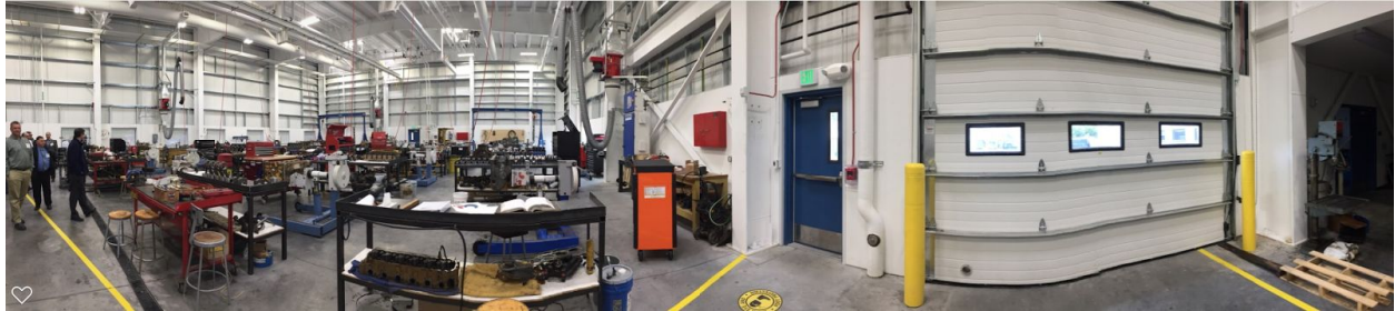
Automotive and engine repair - Students disassemble and rebuild engines.

AVTEC - Culinary Arts Program, Maritime Academy, Applied Technology, which includes diesel/heavy technologies, pipe and structural welding, energy and building technology such as construction technology, plumbing and heating, refrigeration, etc. AVTEC also offers coursework in information technology, networking, business and office technology.