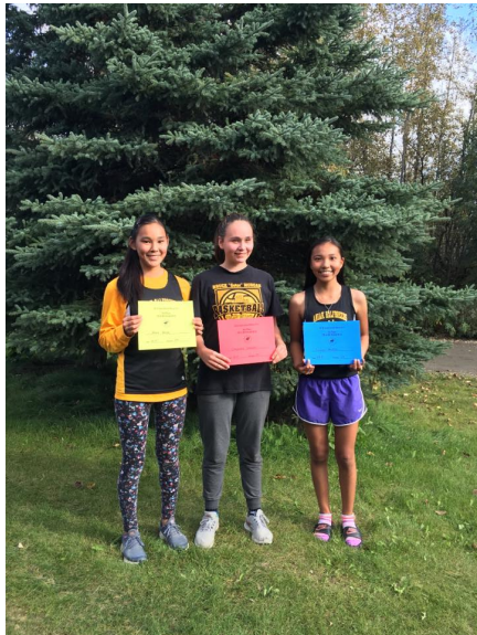
7th & 8th Grade