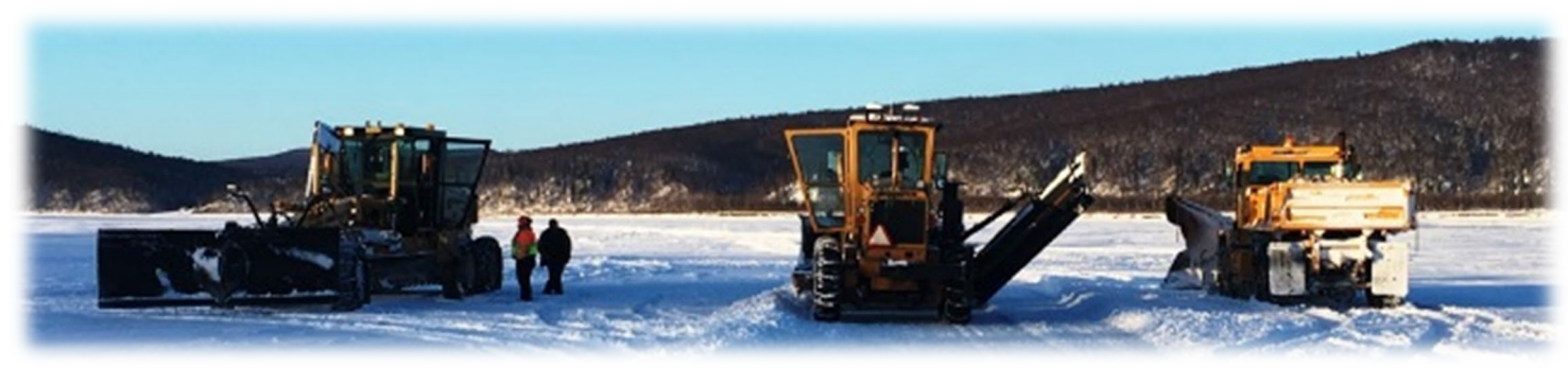
Aniak, Kalskag, and Napaimute Ice Road Crews Working Together for the Benefit of Everybody

With unprecedented financial support from across the region in the first two months of 2020 NVN TTP established a new record for the Kuskokwim Ice Road - 355 miles connecting 21 communities. Much of this work was done side by side with other tribal transportation crews along the River. It is very rewarding work as we see firsthand the benefit it brings to the People: safe, efficient, cheaper winter travel.