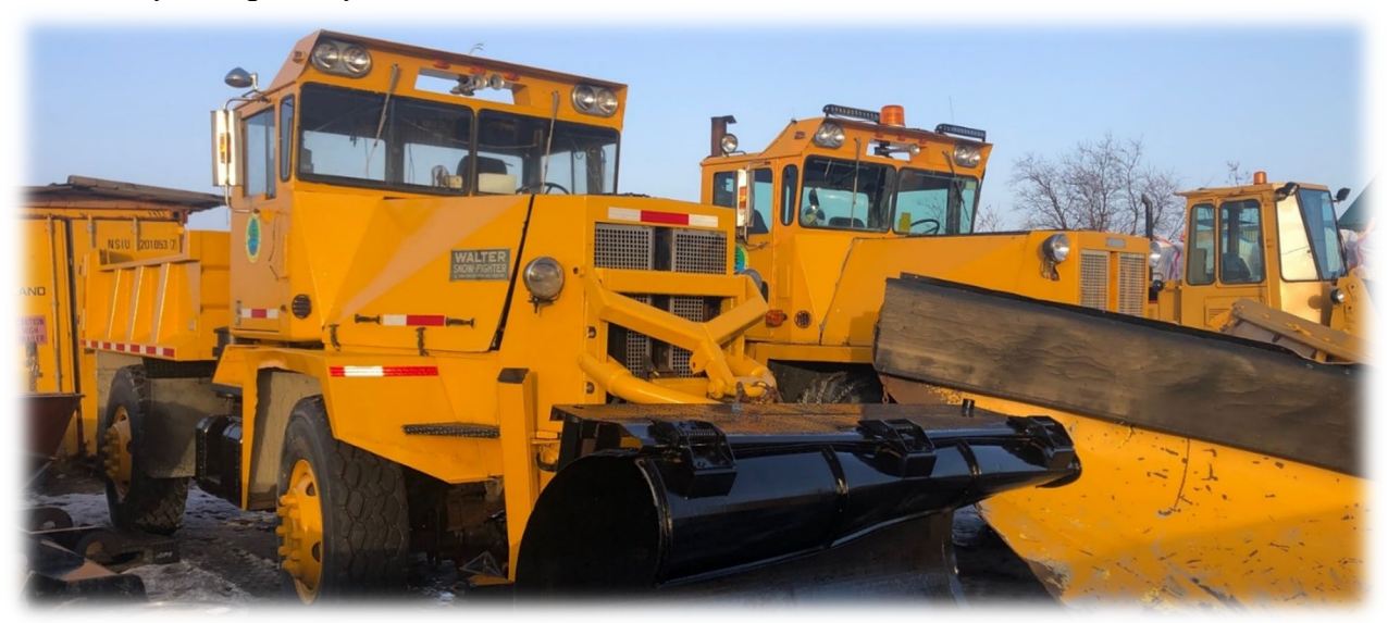
Matching NVN Kuskokwim Ice Road Plow Trucks (L-R): Pirtuk (Blizzard) and Tumlista (one who makes a trail)

In the midst of this COVID-19 Pandemic, having a safe, regularly maintained ice road to Bethel's health care facilities may be especially critical.