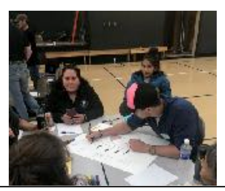
JOGES Staff works on their antibullying goal poster.

Many of the sessions were intended to introduce new teachers to our current curriculum, as well as to introduce all teachers to our new math and science curriculum. The district's adoption of the Big Ideas Math program for K-12 Mathematics meant a full day of professional development on implementing the curriculum in our schools. Our current elementary